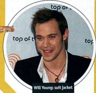
Will Young: suit jacket