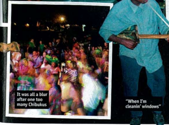
It was all a blur after one too many Chibukus